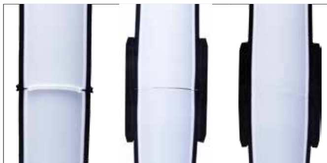
Heated element butt welding

MINELINE I has a white outer layer, but does not have an additional inner layer. The bright surface keeps thermal expansion to a minimum.