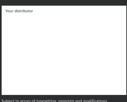
Subject to errors of typesetting, misprints and modifications. Illustrations are generic and for reference only.