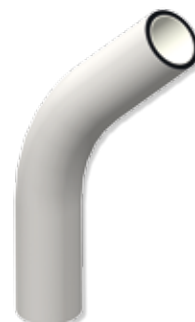
MINELINE II 45 degree r3