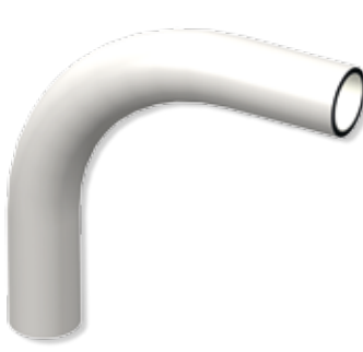
MINELINE II 90 degree r3

Sweep bends are manufactured with an abrasion-resistant inner layer (the MINELINE piping system by AGRU) for use in piping systems that transport abrasive media. The bend radius here is 3 x OD for improved slurry transport.